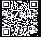
TRB140 360° VIEW