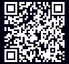
RUT906 360° VIEW